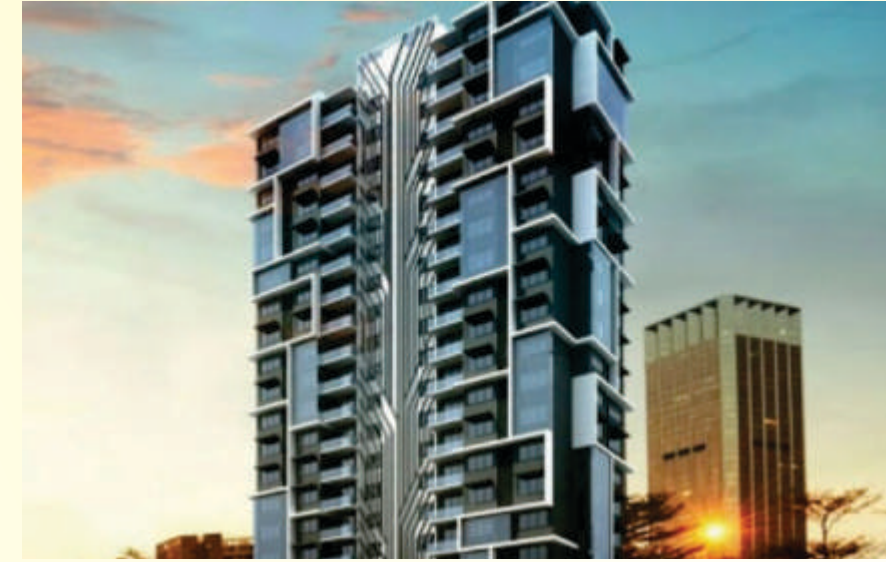
➔ LUXOR: Goregaon West