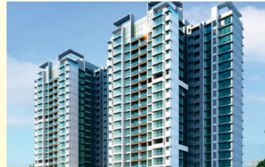
➔ NERO: Bandra East