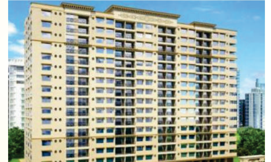
VEDA: Andheri East ←